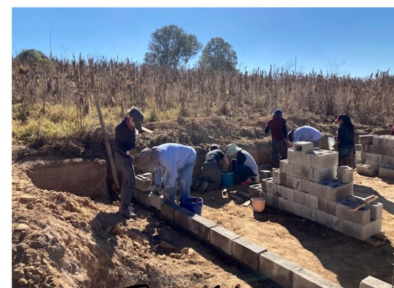
The work begins

Thank you to those who supported us by donating money, praying for us, and encouraging us. I believe we represented you well! It is a gift to be able to be the hands and feet of Christ in the world through our relationship with Pura Vida!