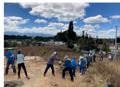
The very important chain!