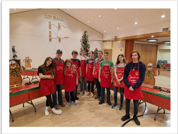
The return of the Cookie Jar fundraiser for FUMC youth! Thank you to those who baked cookies and helped with this yummy tradition that raises money for youth missions and ministry.