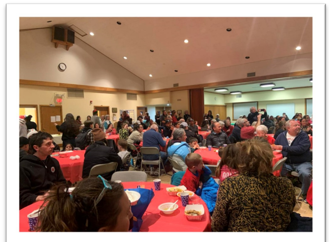
Pozole dinner fundraiser for Truscott Elementary School on December 14