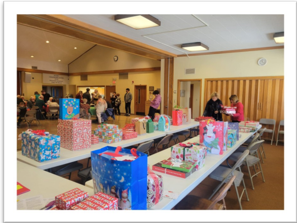
Angel Tree gift giving...a great turnout of gifts for children of incarcerated parents. We're grateful for your generous hearts!

some ways that we gathered, gave, and were blessed in return.