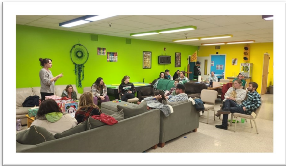
Children and adults of Union Ministry gather to decorate cookies for shut-ins and learn and celebrate together. Thank you to those who support this important ministry with your prayers or service!