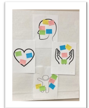
Head, hands, whole body, and heart ideas board