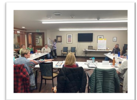
Afternoon idea sharing